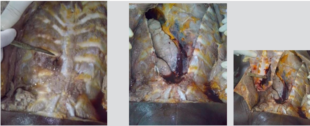
FIGURE I, II, III. Picture showing laceration to the left 4h intercostals space (figure I), haemothorax (figure II) and haemorrhage in the inner lining of the sternum (figure III)