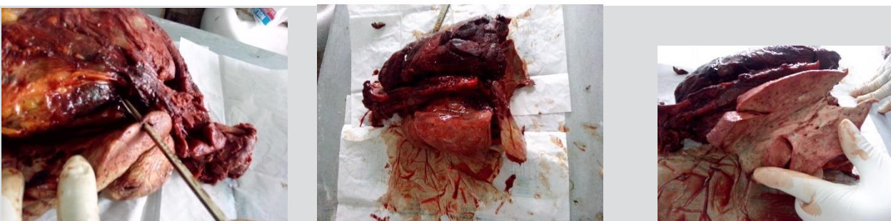
FIGURE VII, VIII, IX. The sections show the laceration on the heart and congestion on the lung due to haemothorax with pallor of the other side.