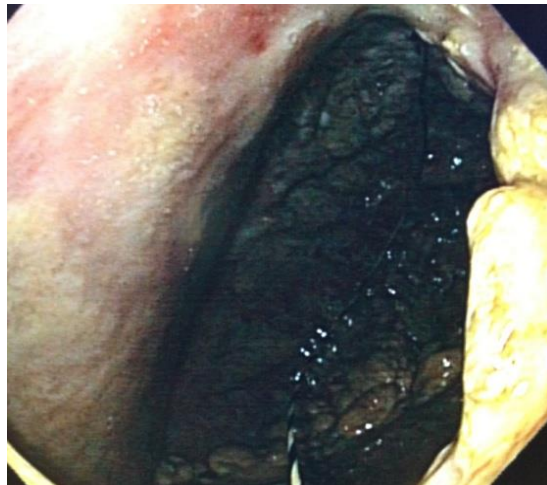
Figure 2: Endoscopic view of large perforated duodenal ulcer