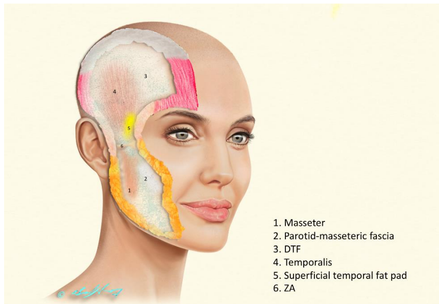
Figure 3: A window into the next layer The Parotid-masseteric fascia in cheek region - the Deep temporal fascia (DTF) in the Temporal region, specifically its superficial layer. Reflections of temporalis, masseter muscles, zygomatic arch (ZA) and the superficial temporal fat pad can be observed underneath.

Proximally in the preauricular area, the vascular pedicle is situated on surface of the TPF, however as going cephalad they gradually take more superficial position. At approximate level of 10 cm above the crus helix, the vessels penetrate the subdermal fat and eventually enter the subdermal plexus, generally at 12 cm above crus helix and that represents the limit of the fascial vascular domain [6]