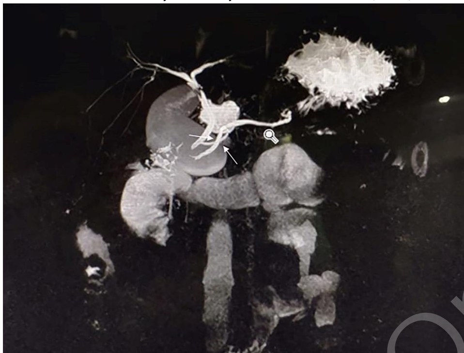
Figure 1 - Magnetic resonance imaging exhibiting Ansa Pancreatica. Magnetic resonance cholangiopancreatography displays a looping duct in the pancreatic head (white arrows) opposed to a conventional accessory duct. On this image, the additional duct can be spotted crossing the main pancreatic duct.